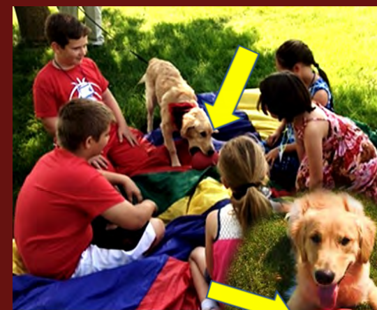
St. John's Lutheran Danforth, IL