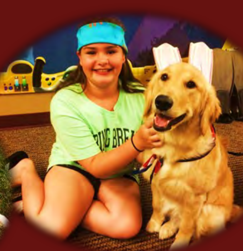
St. John's Lutheran, Lake Twp Fort Wayne, IN