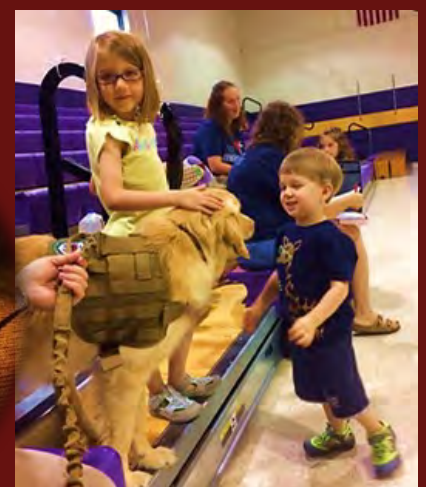
Suburban Lutheran Fort Wayne, IN